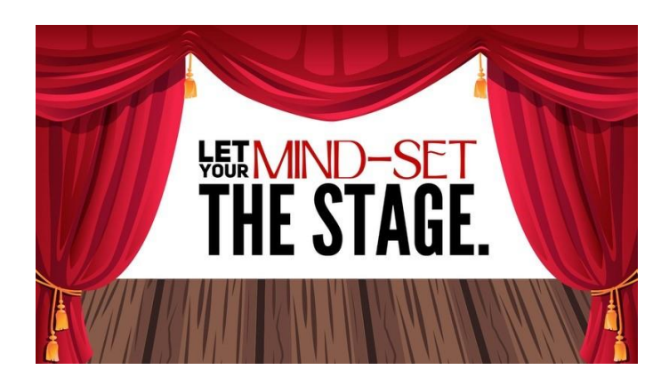
Make it a great 2024-25!